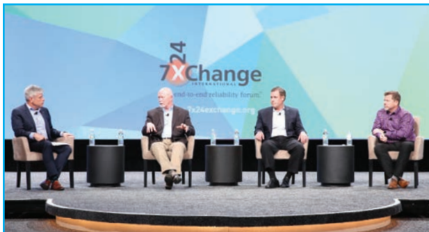
Fall Conference Technology Advancements Panel

Leadership Logic Consulting and the Allied Testing & Commissioning Council will present 7x24 Exchange International and its Board of Directors with the prestigious 2018 Platinum Heart Award, specifically for the delivery of innovative national conferences to the Data Center and Mission Critical Operations Industry! The award is given in recognition of individuals and organizations whose contributions, innovations, and passion positively impact and support the information technology and mission critical operations industries.