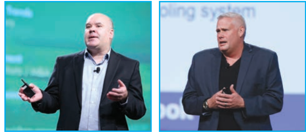
Fall Conference speakers sharing knowledge with attendees

Today's hyperscale facilities continue to place efforts on design models involving common elements such as diesel engine generators and traditional UPS systems. These elements are often designed to provide extended off-grid runtime, reaching a point of diminishing returns. The presenters will discuss new battery storage technology for data centers and the application of incorporating the technology for backup power and power conditioning into hyperscale facilities. Integration of the battery storage system technology will be discussed on a technical level as well as the associated design challenges and schedule drivers.