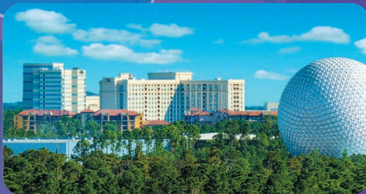
Hilton Orlando Bonnet Creek

Please Note: Room reservations are available on a first come, space-available basis. Space permitting, this block will be available until May 2nd, 2018. Register for the conference and make your hotel reservations early, as this block will likely sell out. Previous 7x24 Exchange conference room blocks have sold out. 7x24 Exchange is not responsible for matching rates or finding additional rooms once this block is sold out. 7x24 Exchange makes every effort to reserve the appropriate number of room nights for attendees. In the event of a sellout 7x24 Exchange will recommend nearby accommodations.