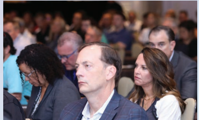
Attendees learning at Fall Conference

6:30 P.M. – 9:30 P.M. Vintage Western Carnival