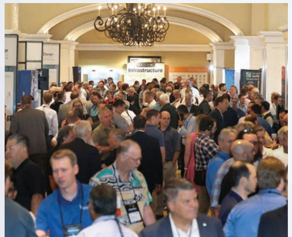
Fall Conference attendees networking

Join us for a reception with open bar and buffet dinner accompanied by music. This is an excellent opportunity to dialogue with conference presenters, meet new people, network, welcome first time attendees, renew old acquaintances, and meet the board members.