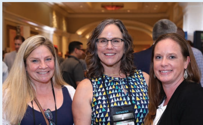
WiMCO Networking Reception