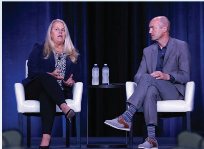
Speakers presenting at the Fall Conference