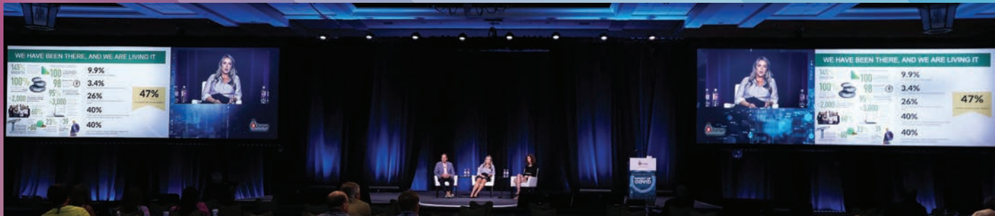
WIMCO Panel at the Fall Conference

END-TO-END RELIABILITY: MISSION CRITICAL FACILITIES