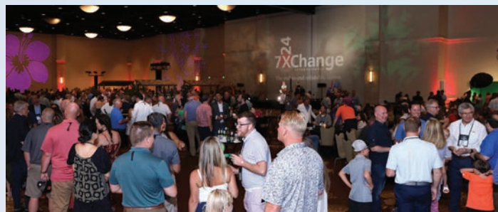
Fall Conference Welcome Reception