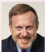
Admiral Mike Rogers

Admiral Rogers shows why and how periods of turmoil and chaos are often a leader's greatest opportunity to shepherd transformational change. While people and organizations seem hard-wired to favor stability and resist change, necessity forces the hand of invention. According to multiple analysts and headlines, the global pandemic accelerated the digital transformation of entire industries by three to seven years—and that window of opportunity is still open—not only for technological change but for shifts in organizational culture and the future of work. Admiral Rogers shows leaders how to embrace the power of chaos and fully leverage its momentum for change.