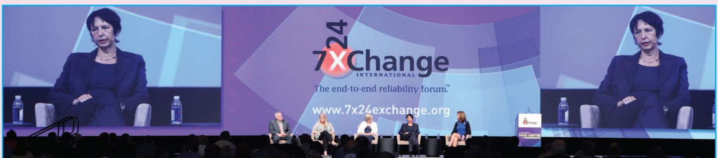
Next Generation of Talent Panel at the Spring Conference.