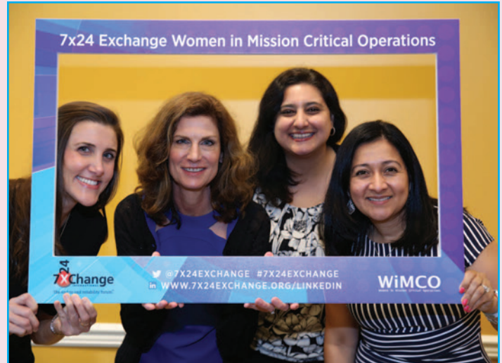
WiMCO* committee members enjoying the networking reception.