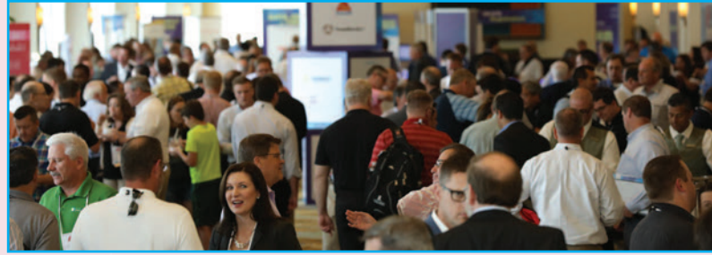
Spring Conference attendees networking.

Sales Manager – Data Centers, Saft America, Inc.